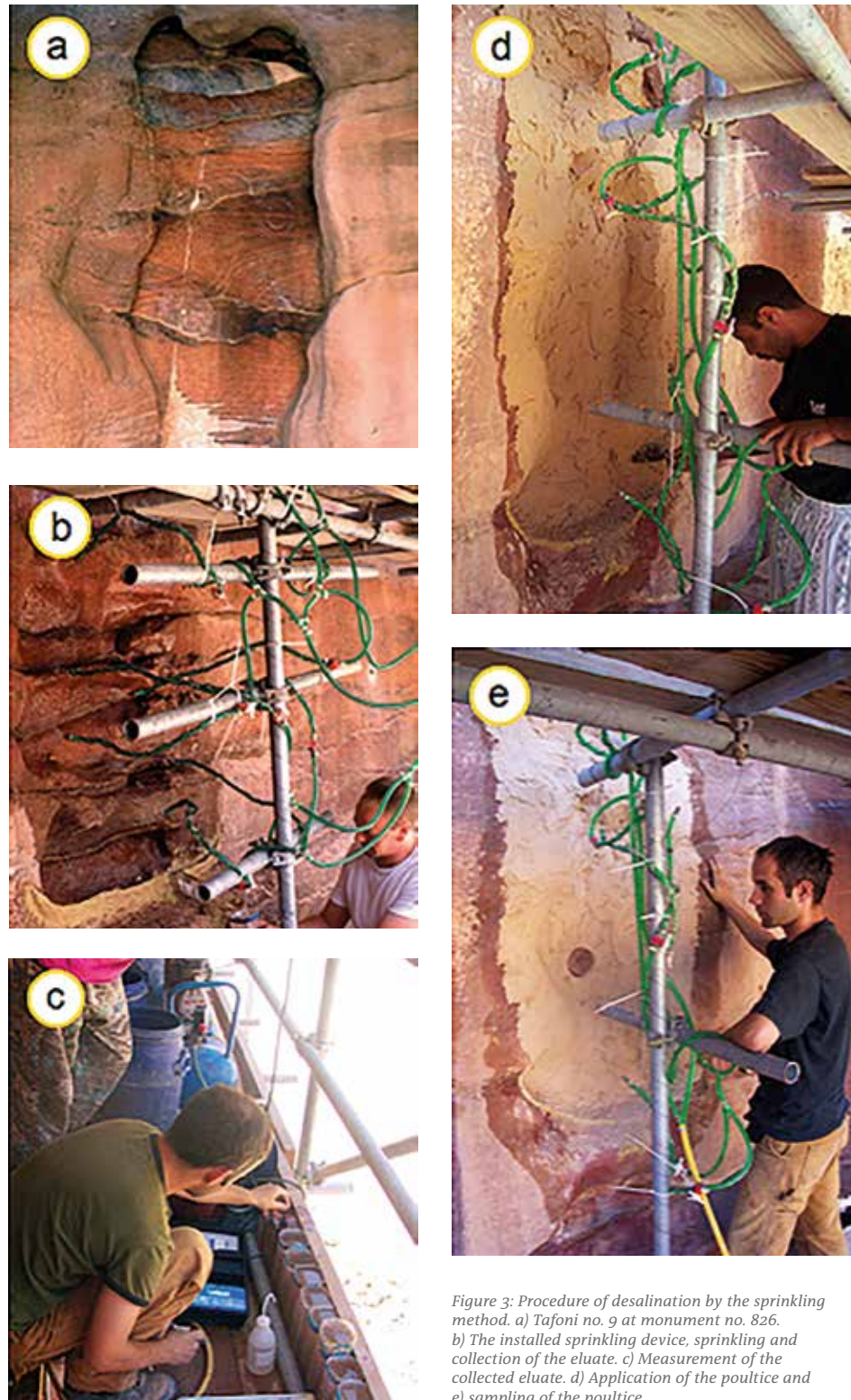
Figure 3: Procedure of desalination by the sprinkling method. a) Tafoni no. 9 at monument no. 826. b) The installed sprinkling device, sprinkling and collection of the eluate. c) Measurement of the collected eluate. d) Application of the poultice and e) sampling of the poultice.

conservator Egon Kaiser and one of the authors. These consisted of a wet mixture of cellulose and washed sand in a proportion of 1:5, and in general, showed a good workability as well as promising results in the beginning. The moist poultices were applied in square patches on the salt contaminated areas and were removed after drying (see Figure 4d).