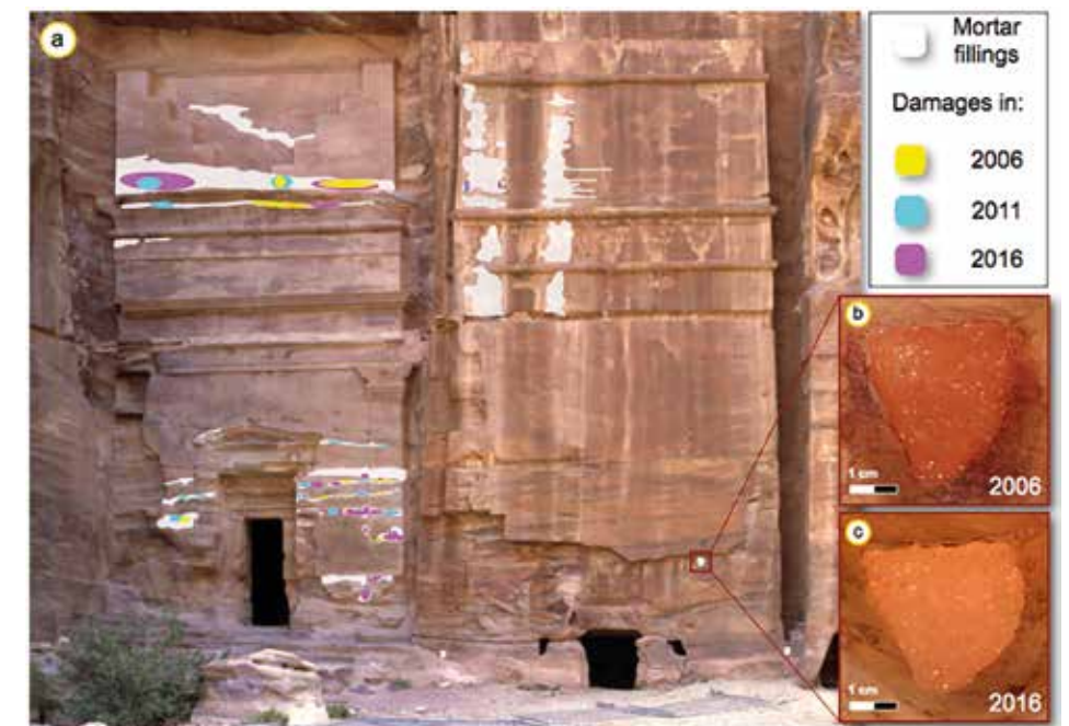
Figure 4: a) Ongoing damage progress of restored areas treated with silica-sol mortars during a period of 15 years on monument 825. b) Sample of a dry-slaked lime mortar just after application in 2006 and c) after 10 years.